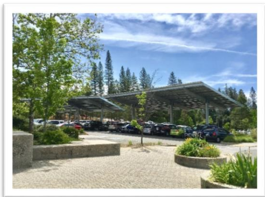
Completed installation of the solar arrays at the Eric Rood Administration Center in Nevada City, CA.

Deployed in 2016, the Solar Generation and Energy Efficiency Program consists of a variety of improvement projects at several Nevada County facilities, including five solar installation sites at the Eric Rood Administration Center, Wayne Brown Correctional Facility, Carl F. Bryan II Juvenile Hall, Lake of the Pines Wastewater Treatment Plant, and the Highway 49 Ranch Property. To date, three of the five solar sites have been completed.