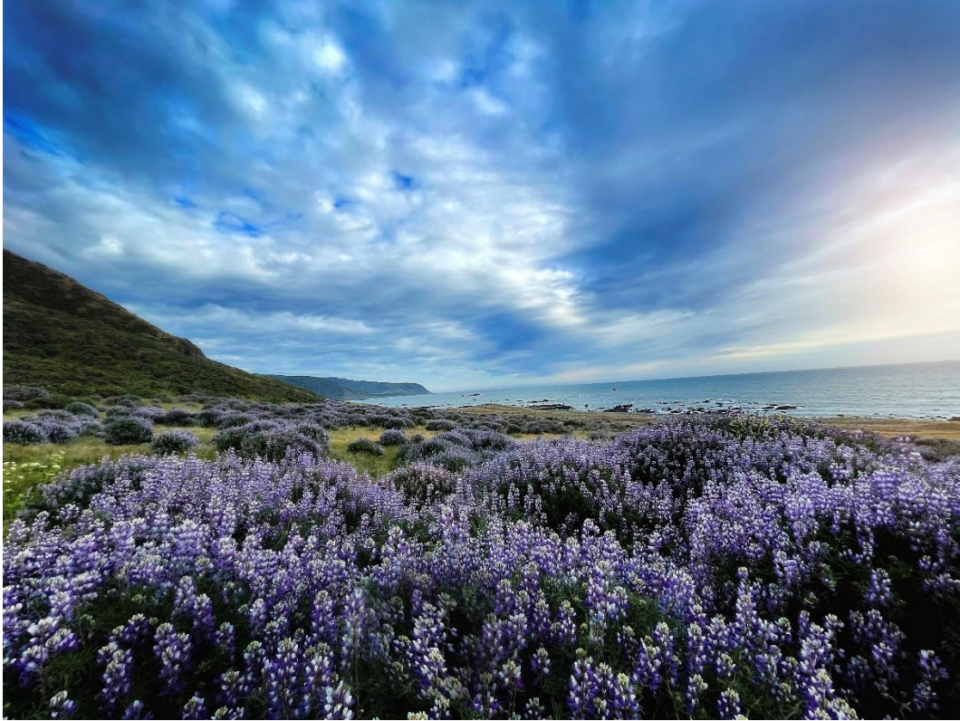
Second Place Photo by Miranda Moore, Humboldt County