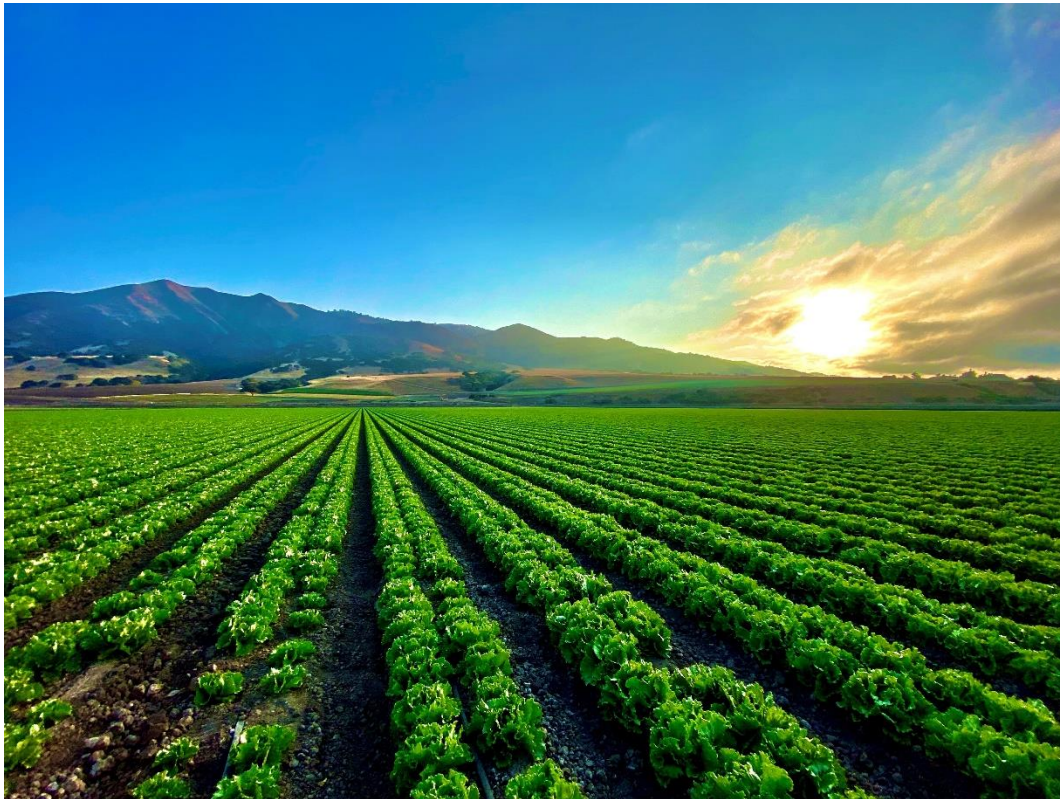
First Place Photo by Ramiro Ruiz, Monterey County