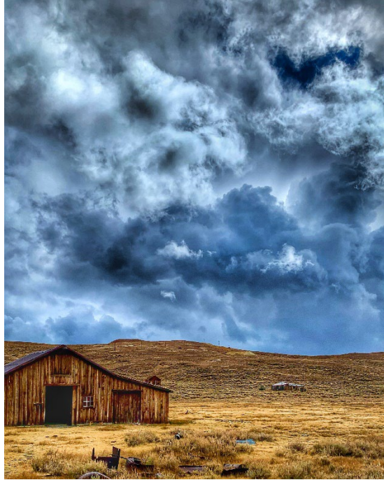
Second Place Photo by Scott Suppus, Mono County