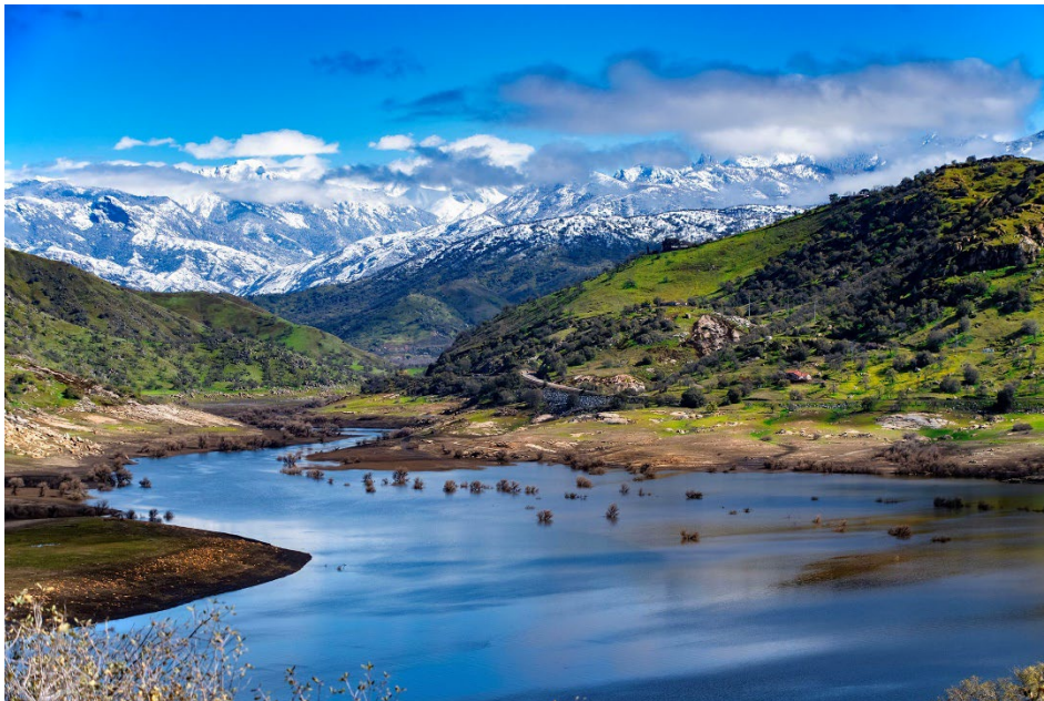
First Place Photo by Arlene Winfrey, Tulare County